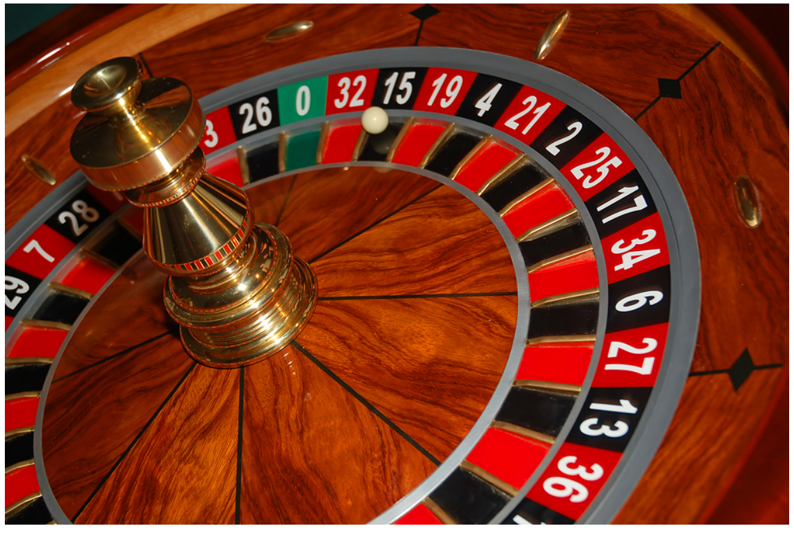
South Dakota Commission on Gaming FY18 Annual Report

During the year the Commission authorized the destruction of five slot machines that were being sold to the public that had been seized by Commission on Gaming Enforcement Agents as contraband. The Commission approved rules for an optional blackjack side bet known as "TriLux Bonus", an optional side bet for craps called "Sharp Shooter" and an optional side bet for select house banked poker games called "Cover All Bonus". The Commission also adopted rules relating to the licensing of manufacturers and distributors of associated equipment.