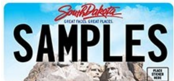
Personalized Plate: Vehicle & Motorcycle & Low Speed Plate