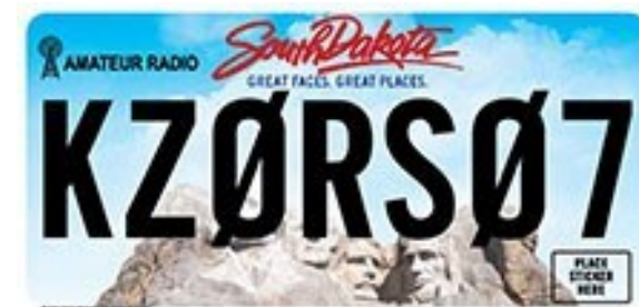
Amateur Radio Vehicle