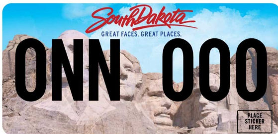
Standard County Vehicle Plate

Below are examples of all of the plates currently being reissued: