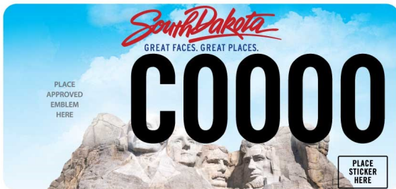
Emblem Plate: Vehicle & Motorcycle