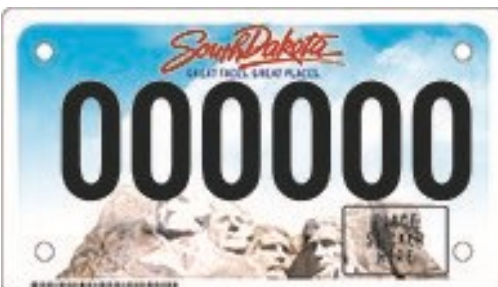
Standard Motorcycle Plate